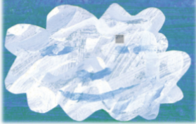
Little Cloud by Eric Carle